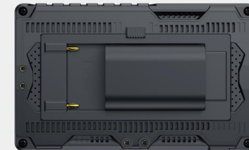
Canon LP-E6 Battery